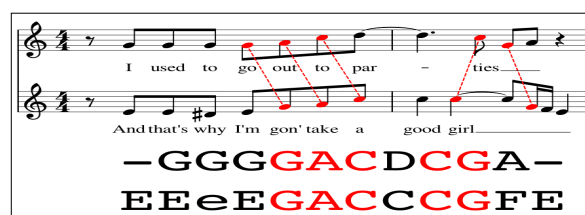
Figure 4. Comparison of the “signature phrase” from Marvin Gaye’s Got To Give It Up (top) and Robin Thicke and Pharrell Williams’ Blurred Lines (bottom). PMI = 45% for this phrase (19% for the full melody).